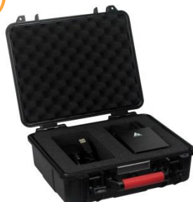
Carrying Case ART7-CSE