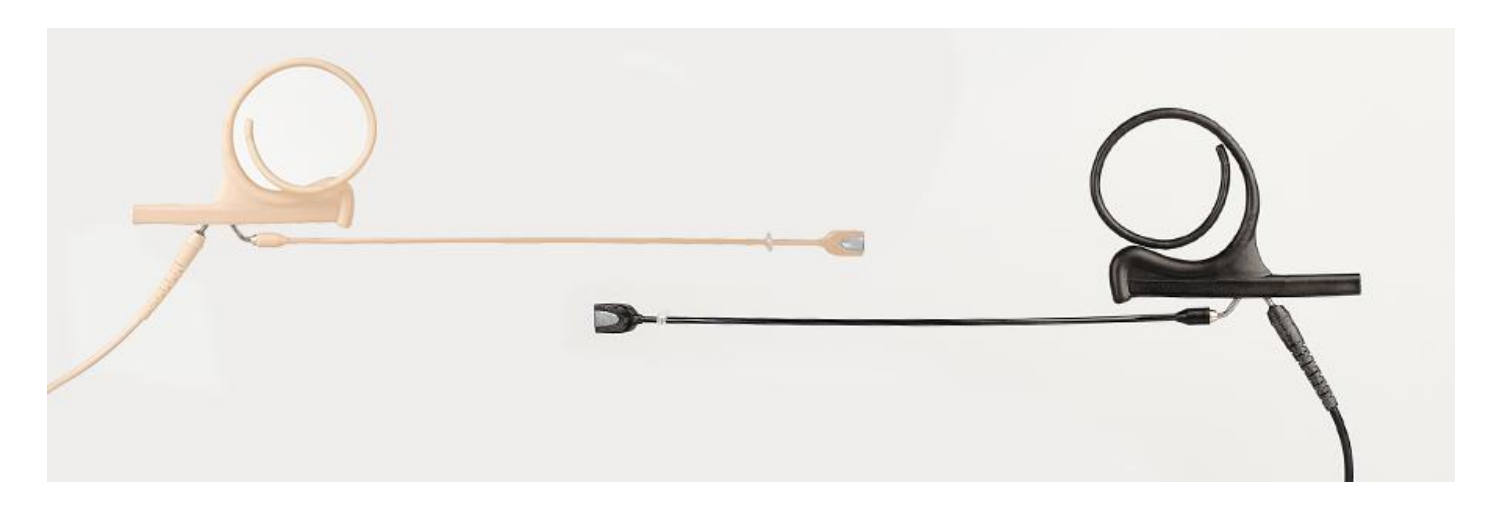
FIOB00, d:fine™ omni headset mic, single-ear

Watch YouTube video: tips & tricks on how to work with the d:fine™